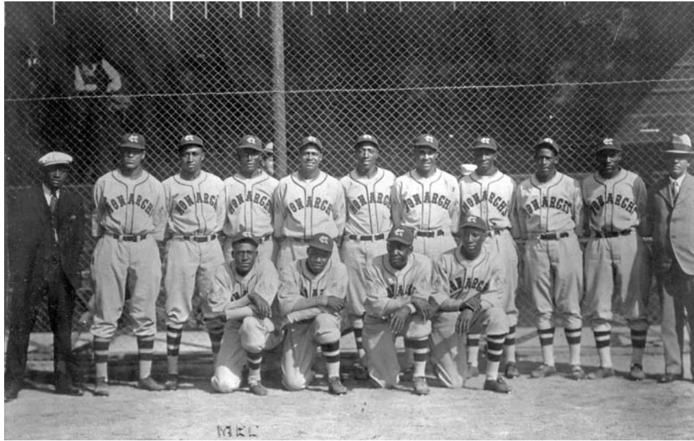
Demonstrating the importance of baseball to the local black community, the hugely successful Kansas City Monarchs were described as “the life of Kansas City in the Negro vicinity.” The Monarchs, led by one of sport’s most accomplished players, Leroy “Satchel” Paige, and press coverage of the team wherever it barnstormed, contributed as much to the integration of baseball in Kansas as any other single factor. As if following a Hollywood script, the 1934 Monarchs, picture here, lost the final game of the Denver Post Tournament to the House of David, a Benton Harbor, Michigan, barnstorming team that had hired Satchel Paige as a ringer just for the semi-pro tournament. Paige pitched the “Bearded Beauties” to a 2 to 1 win over his old team to win the $6,500 prize.

change. This silence says a great deal about race relations in the city at the time, when society remained largely indifferent towards race, and when integration on its playing fields simultaneously occurred in at least two ways. First, two Mexican teams were allowed to play in Wichita’s amateur leagues for the first time—the Midgets, also called the Mexicans, in the Junior League, and the Aztecs in the very competitive Commercial League. It is unknown why the Mexican teams were allowed or whether anyone noticed or cared about the teams’ racial composition. Few game results for either team appeared in the Eagle or the Beacon , and no mention is made of the teams’ race or of the social momentousness of the first non-white teams’ entry into the city’s leagues. 13 Unlike Wichita’s African American community, the city’s Mexican community did not have its own newspaper.