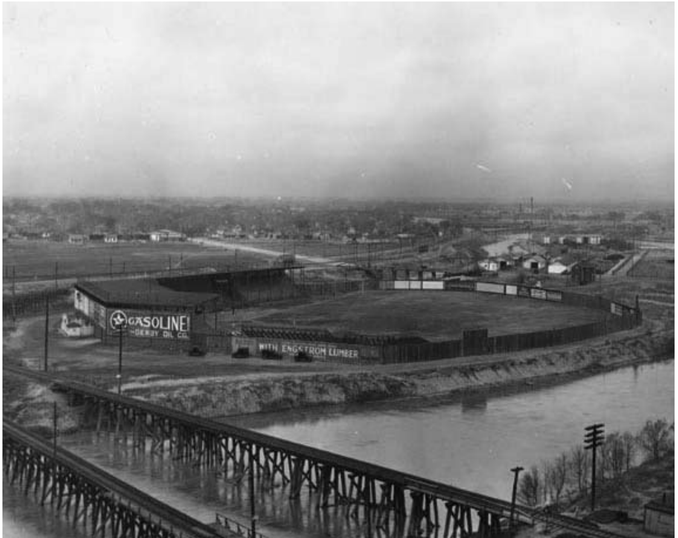
Island Park, Wichita, Kansas, 1925.