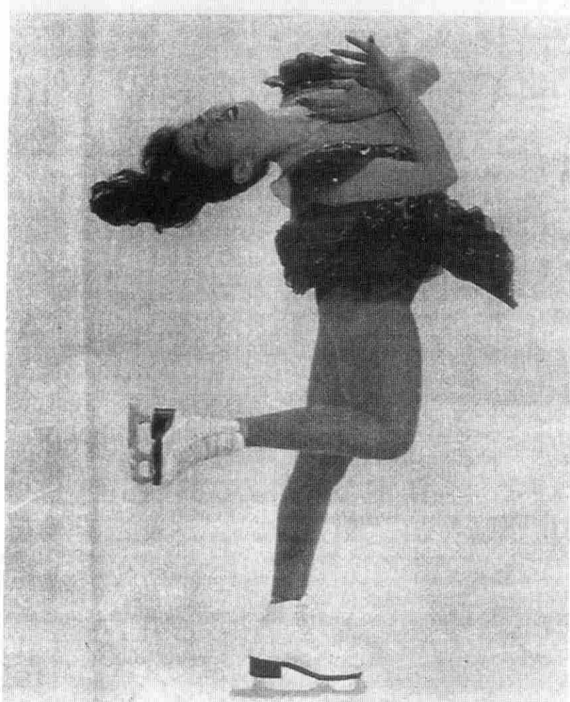
5. Mouth slightly open, open-necked, hands delicately placed across her chest, Kristi Yamaguchi embodies the ultimate feminized "Ladies" figure skating champion in a photo from the Sports Section of The New York Times, 11 January 1992:131.

Kristi Yamaguchi performing in the singles-competition final at the national figure skating championships